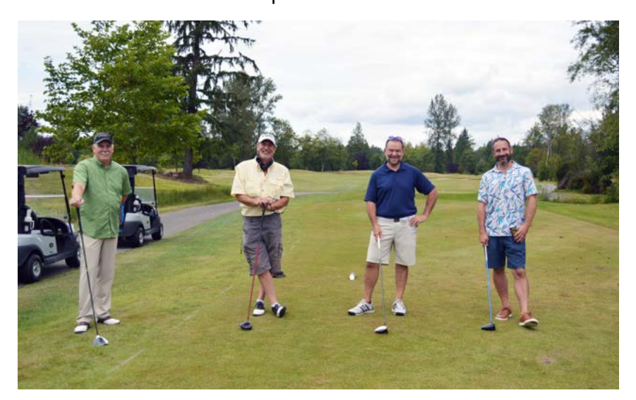
Battle of the Bridge Golf Tournament