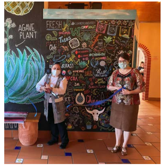
Ribbon cutting at COA