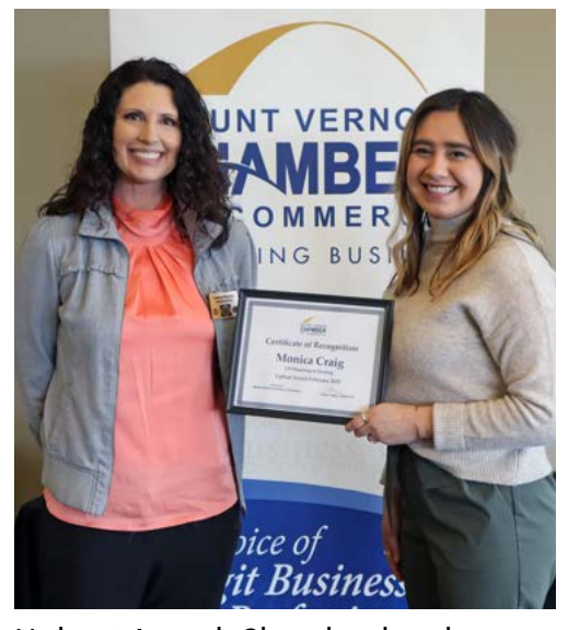
Upbeat Award, Chamber luncheon