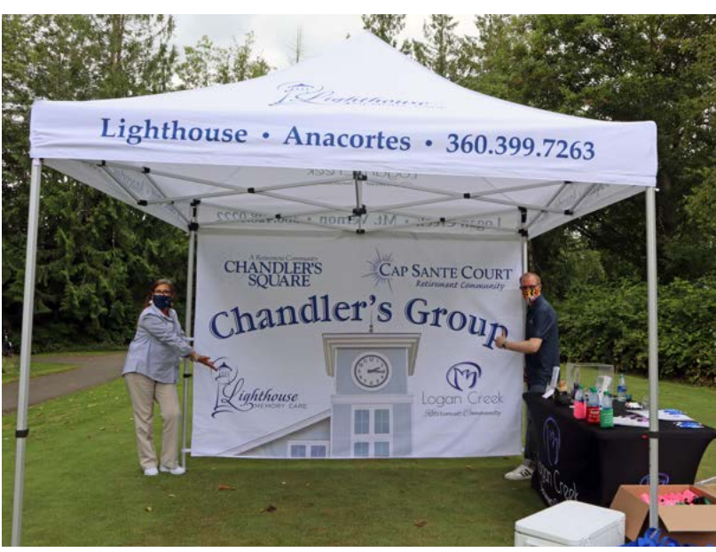
Battle of the Bridge Golf Tournament