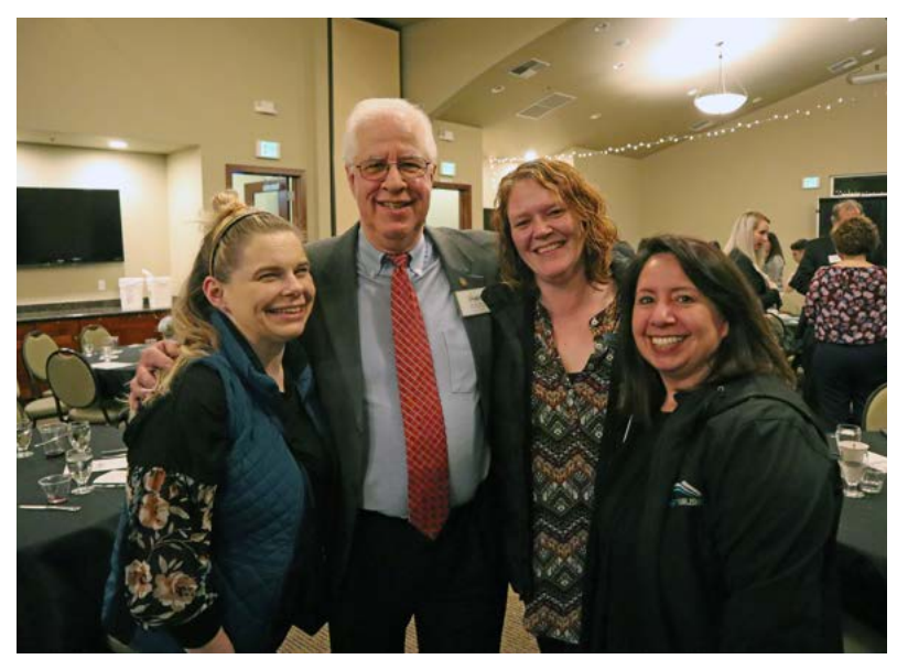
Chamber Awards Dinner