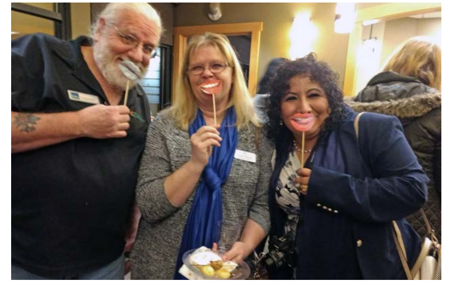
Multi-Chamber After Hours