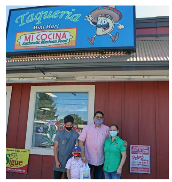
Welcome New Member Taqueria Mi Conina