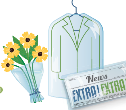
Flowers, Drycleaning, Newspaper Bags, etc.