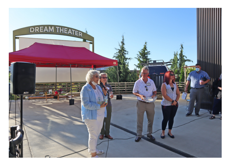
September's Multi-Chamber After Hours took place at Abbott's Alley in Sedro-Woolley.