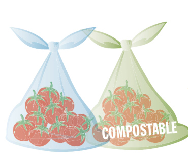
Produce, Meat, Bulk Foods, Bakery Goods, etc.