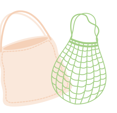
Durable Reusable Bags