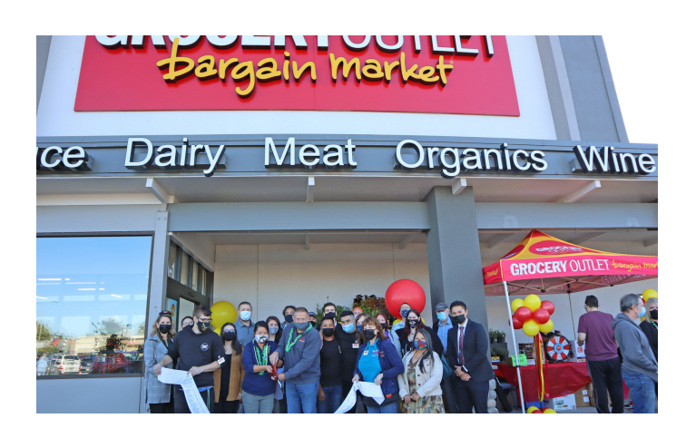
Mount Vernon Grocery Outlet