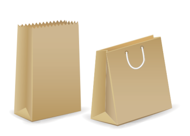
Small Paper Bags