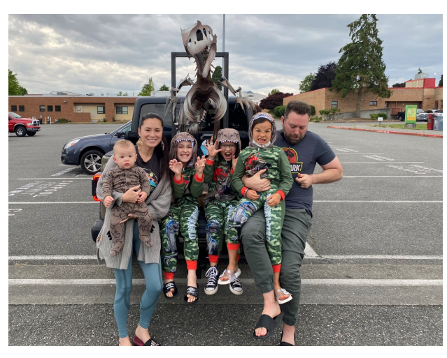
Drive-in Movie Night at Skagit Valley College