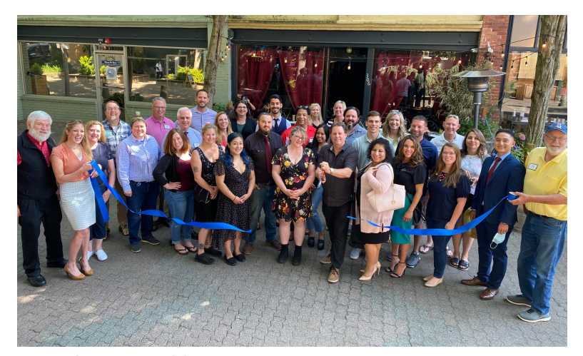
Revival Lounge Ribbon Cutting