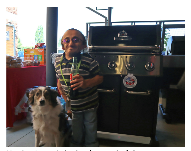
Member Appreciation luncheon at Craft Stove