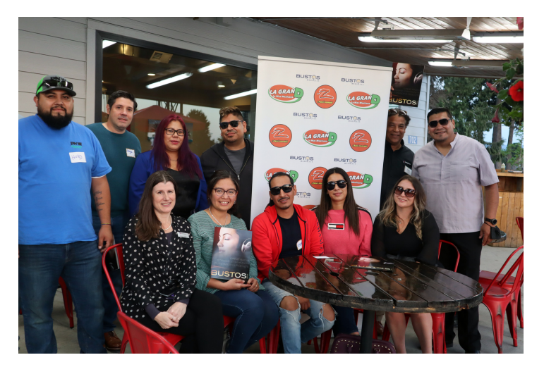
Latino Business Leaders Meet & Greet