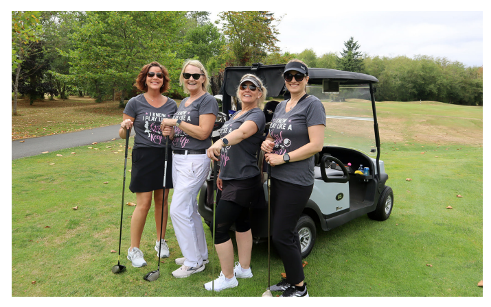
Battle of the Bridge Golf Tournament