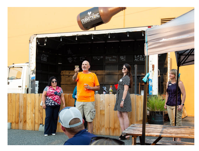
Multi-Chamber After Hours at Farmstrong Brewing