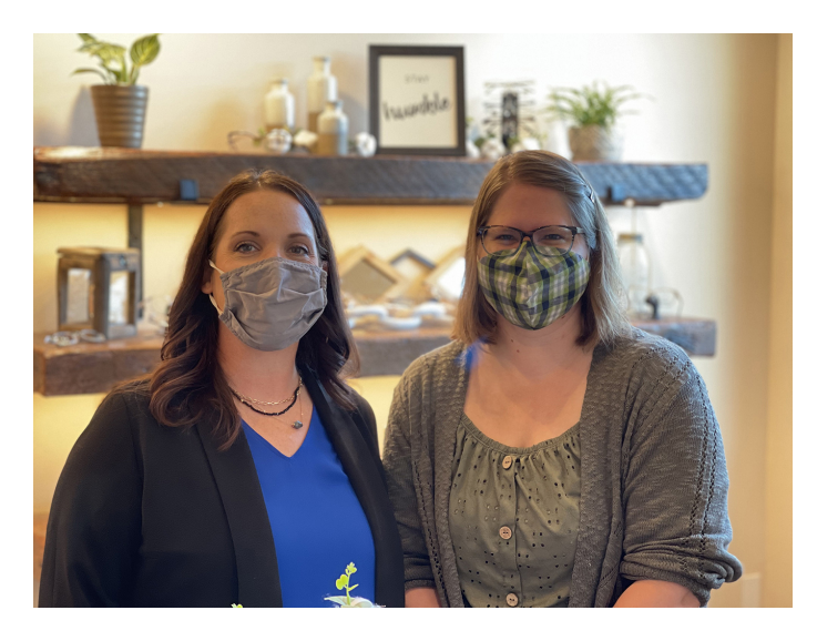
Two members of Cascadia Eye's optical staff. They are among 90 employees at the company.

If you think of eye exams, glasses and contacts when you think of Cascadia Eye, that's only half the story. Cascadia Eye also has a full surgical