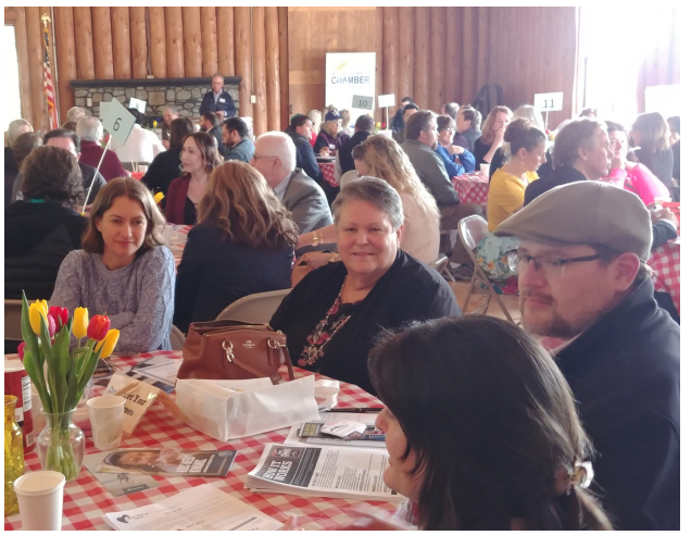
The Chamber's first in-person Biz Buzz in two years brought out a crowd of networkers!

Latino Business Leaders was back in person in April, as well as hosting a separate online event. The same in-person/virtual format will take place in May.