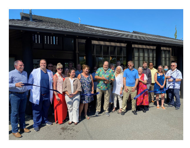
Anderson Podiatry celebrates their new location in Coherence Wellness Center with a ribbon cutting.