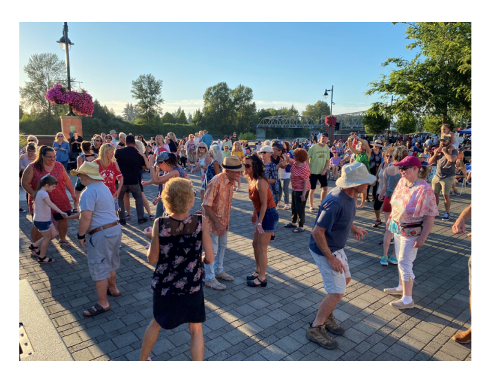
Dancing the night away at the Riverwalk Summer Concert Series