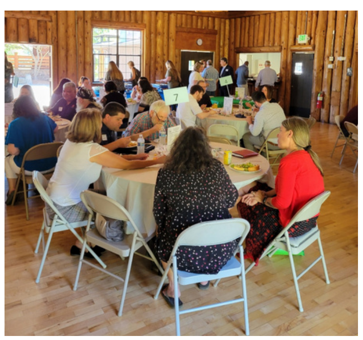
Chamber members network at the Biz Buzz Networking Luncheon