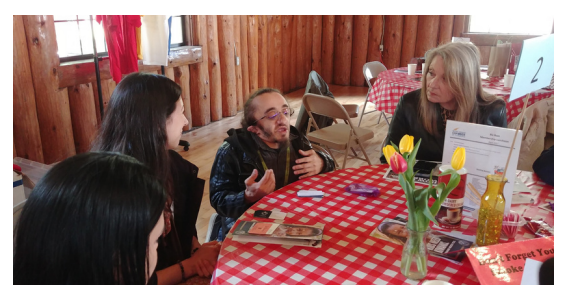
Members network at the Biz Buzz Networking Luncheon