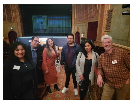
Members network at the Lincoln Theatre After Hours