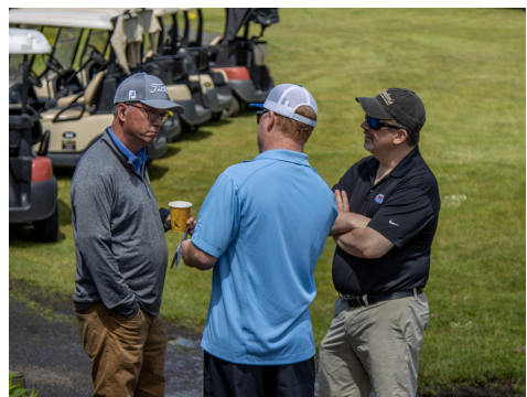
Strategy is important at the Battle of the Bridge Golf Tournament