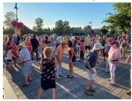
Concert goers rock out at Skagit Riverwalk Park