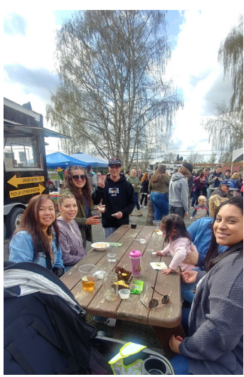
Lots of fun was had at the Skagit Chili & Chowder Cook-Off