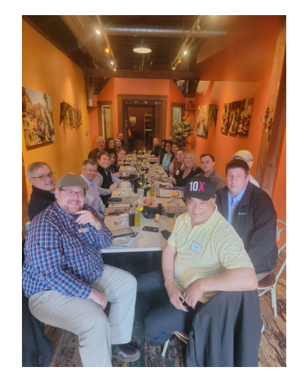
Chamber Connections Social