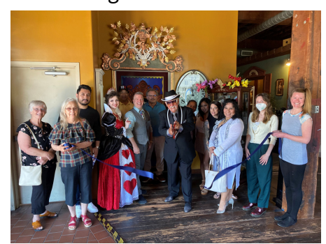
Members celebrate White Branches ribbon cutting