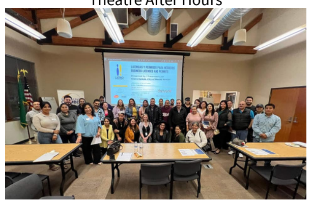
Latino Business Leaders meet at Skagit Station