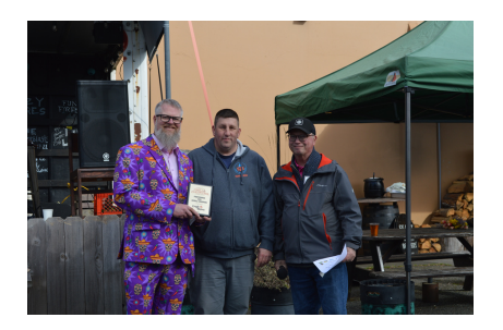
1st Place professional chili Swinomish Casino & Lodge