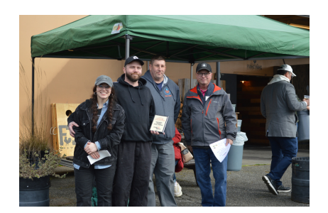
1st Place professional chowder Skagit River Brewery