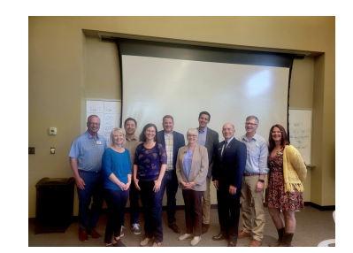
Skagit Chamber Alliance Roundtable Discussion