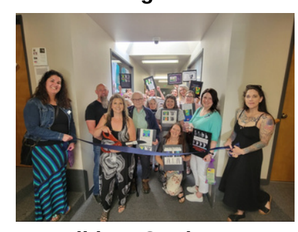
Ribbon Cutting at Skagit Thermography