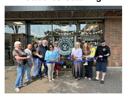
Ribbon Cutting at Made and Found Market