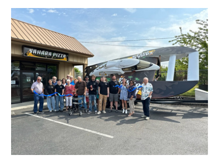
Ribbon Cutting at Sahara Pizza