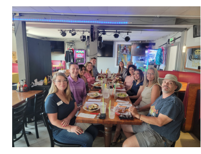
Ambassador Meeting at Conway Pub and Eatery