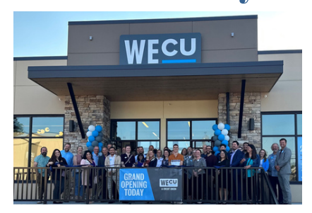
Ribbon Cutting at WECU Picture from June