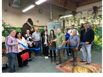
Ribbon Cutting at Mystical Wares