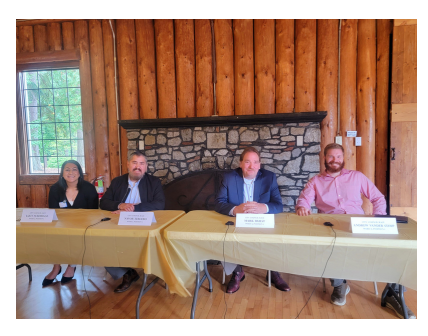
Membership Luncheon Candidates Forum