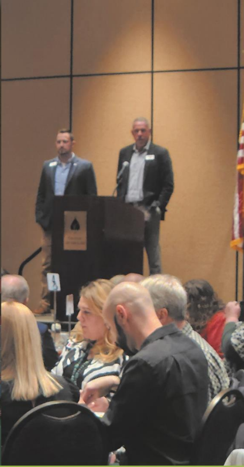
Table Rock Lake Chamber of Commerce