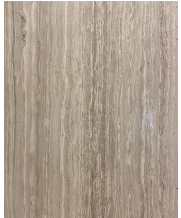
“teakwood” marble thin-stone