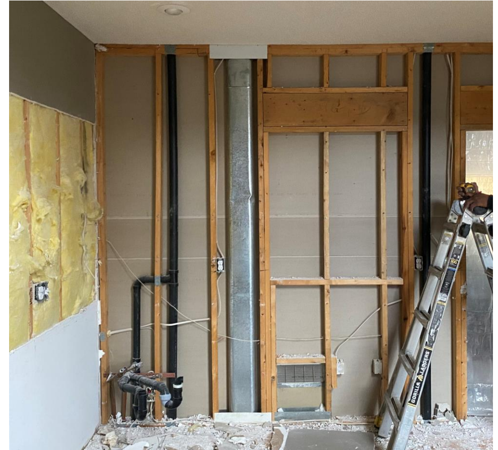
demolition day: unexpected challenges at the sink wall