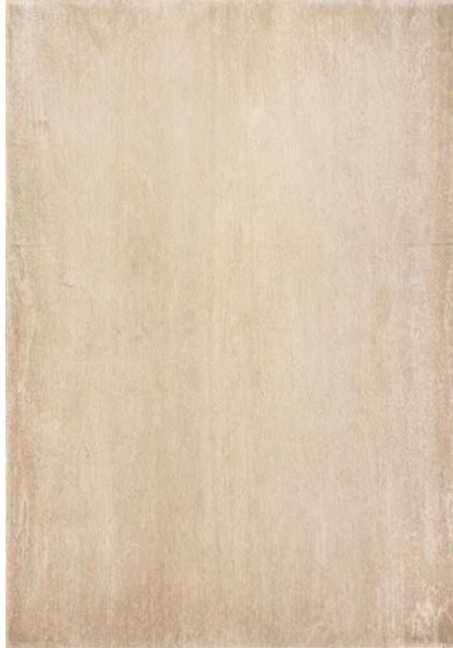
cabinet door sample with custom character stain