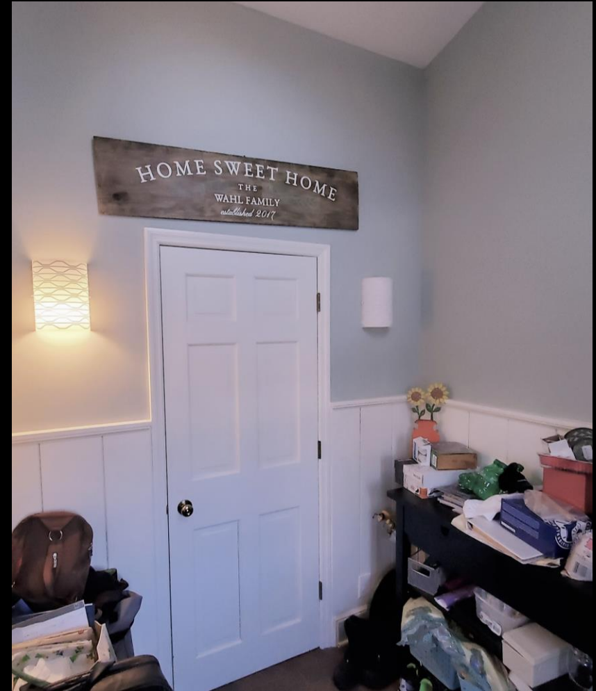
Mudroom with closets and landing top