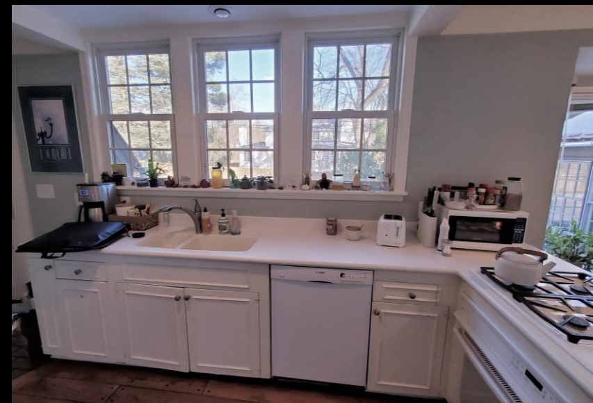
Sink wall with speedcook oven