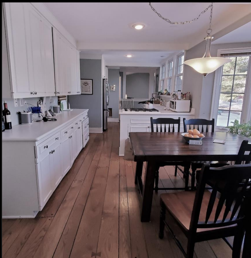
Table turned 90 degrees to clear the walkway.