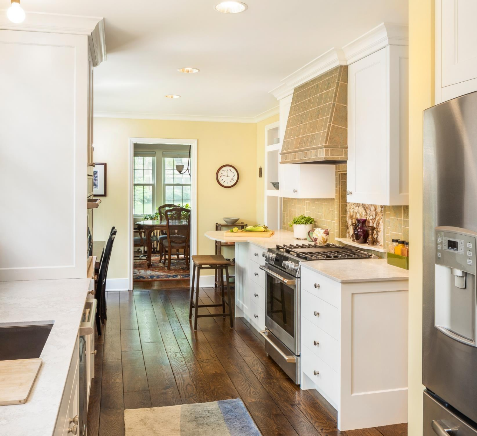
New range location