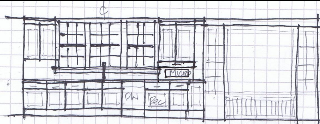
EAST FLEX. Kitchen \frac{1}{4}'' = 1'-0