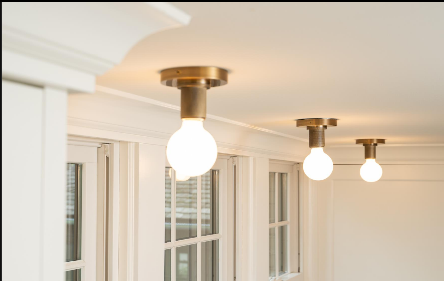
Vintage vibe fixtures