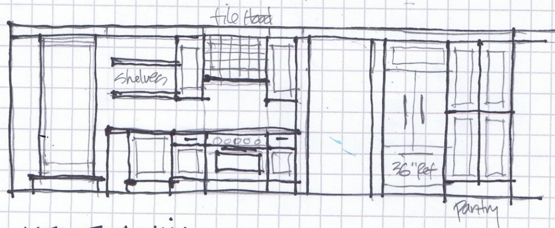
WEST FLEX. Kitchen \frac{1}{4}'' = 1'-0