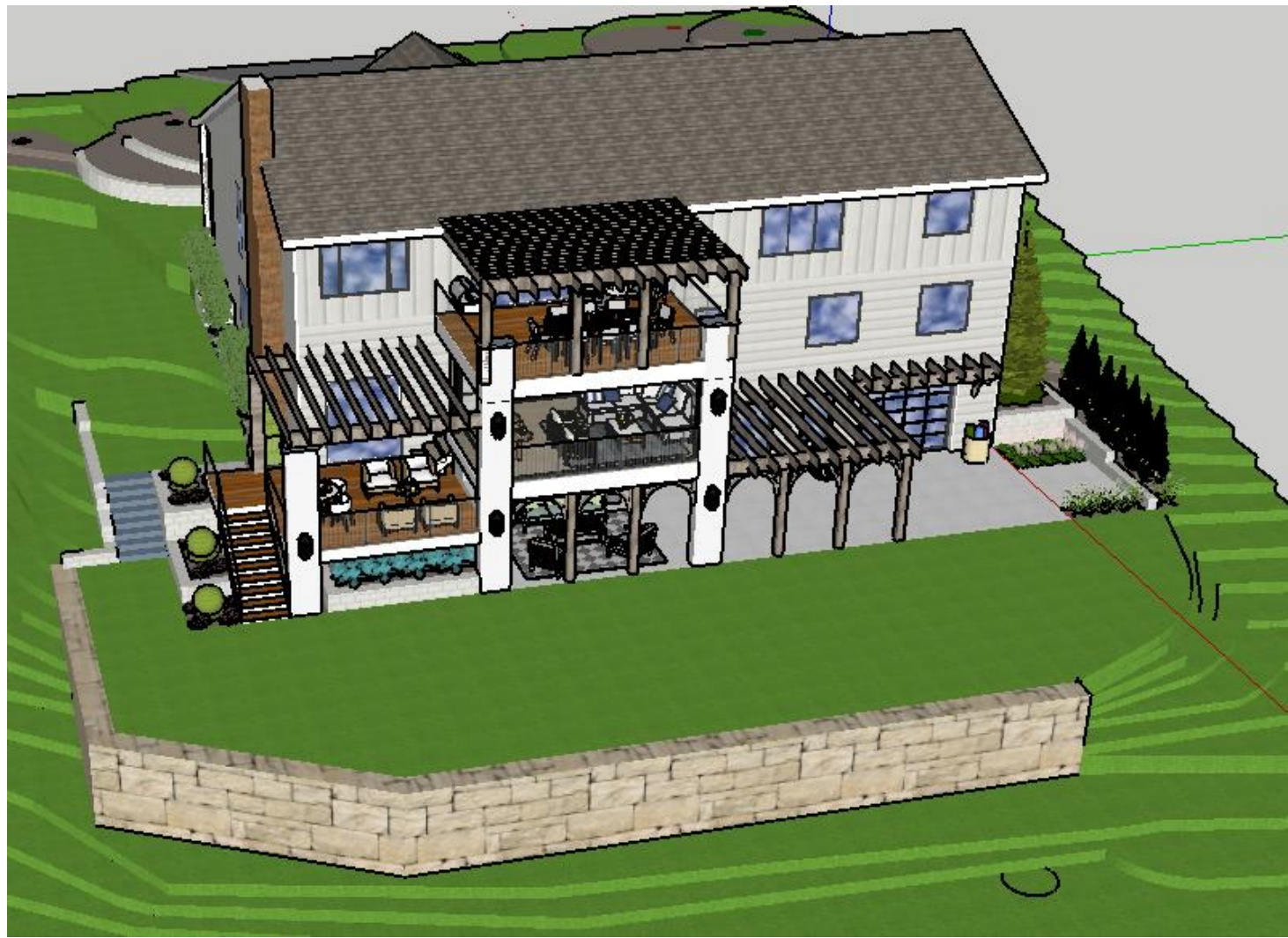
3D MODEL OF DESIGN