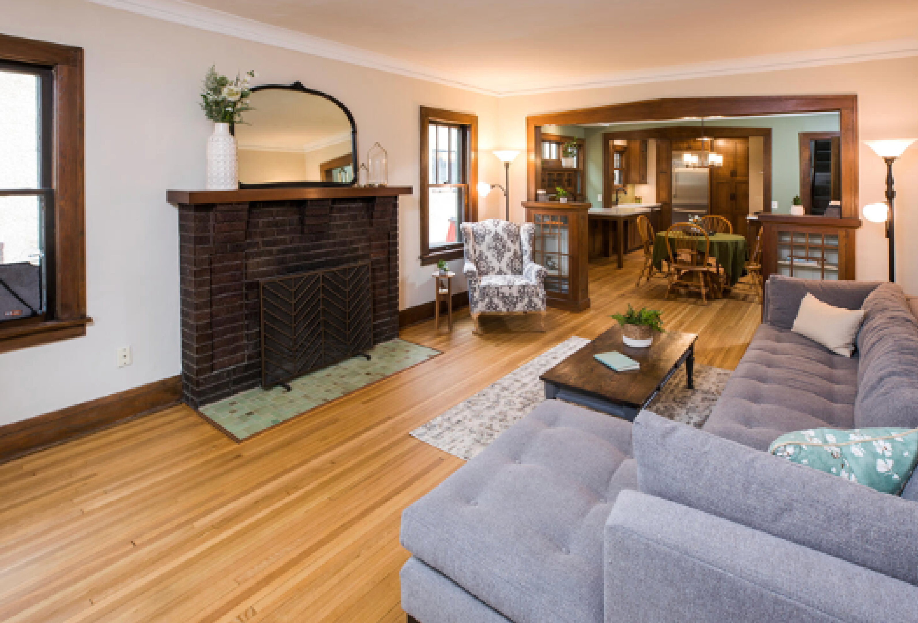
After Living Room