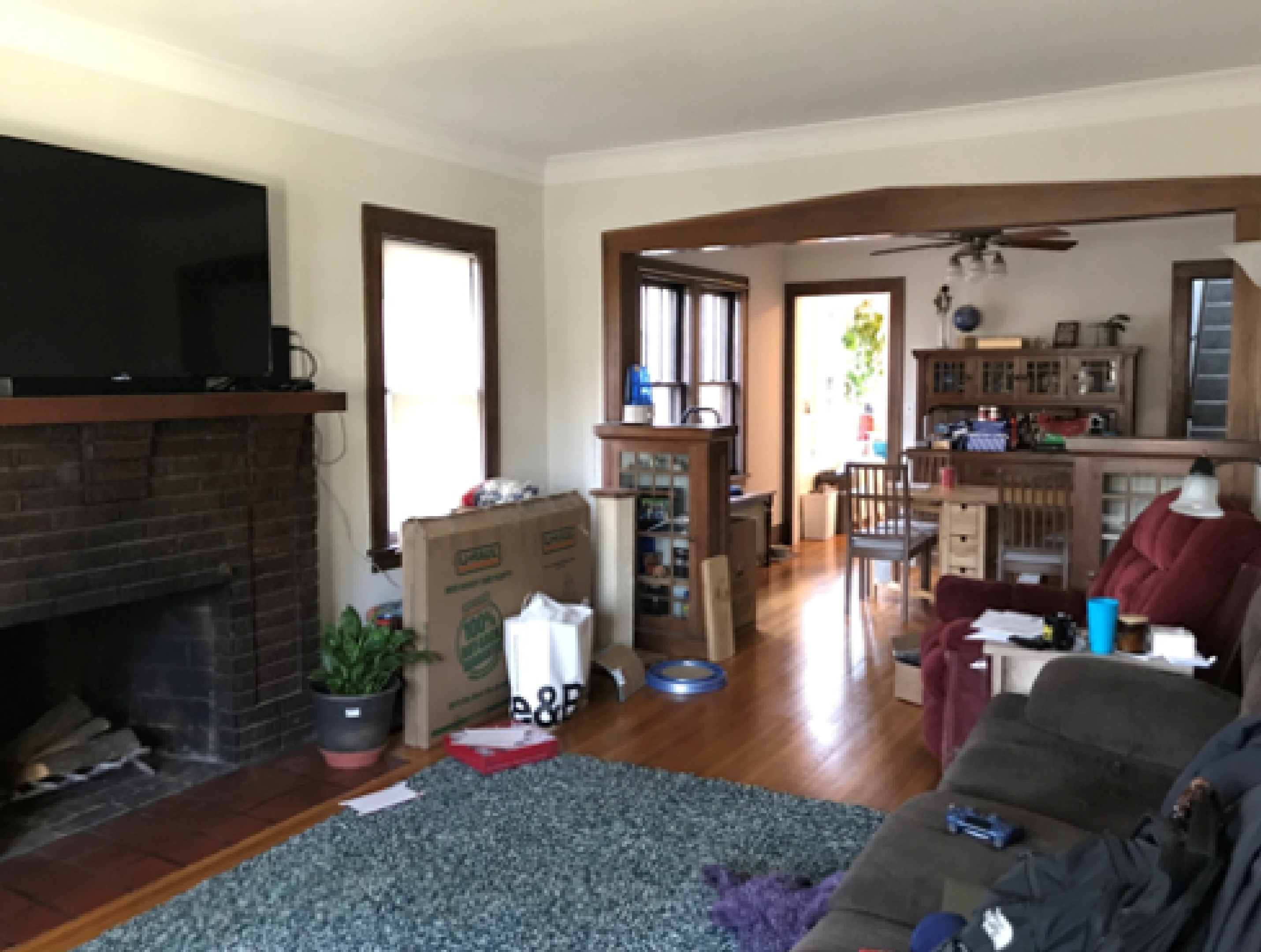
Before Living Room