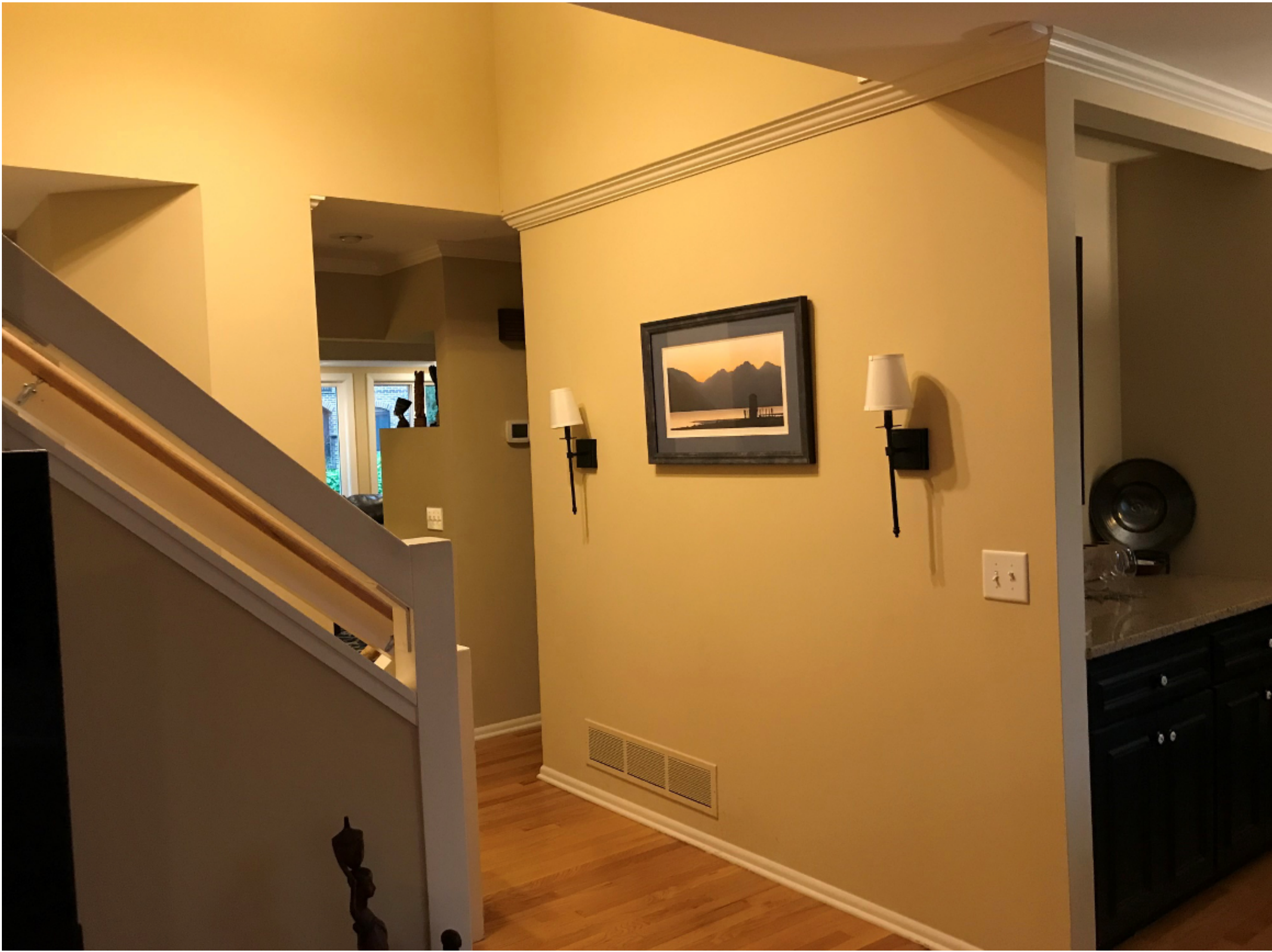
Before Staircase Area