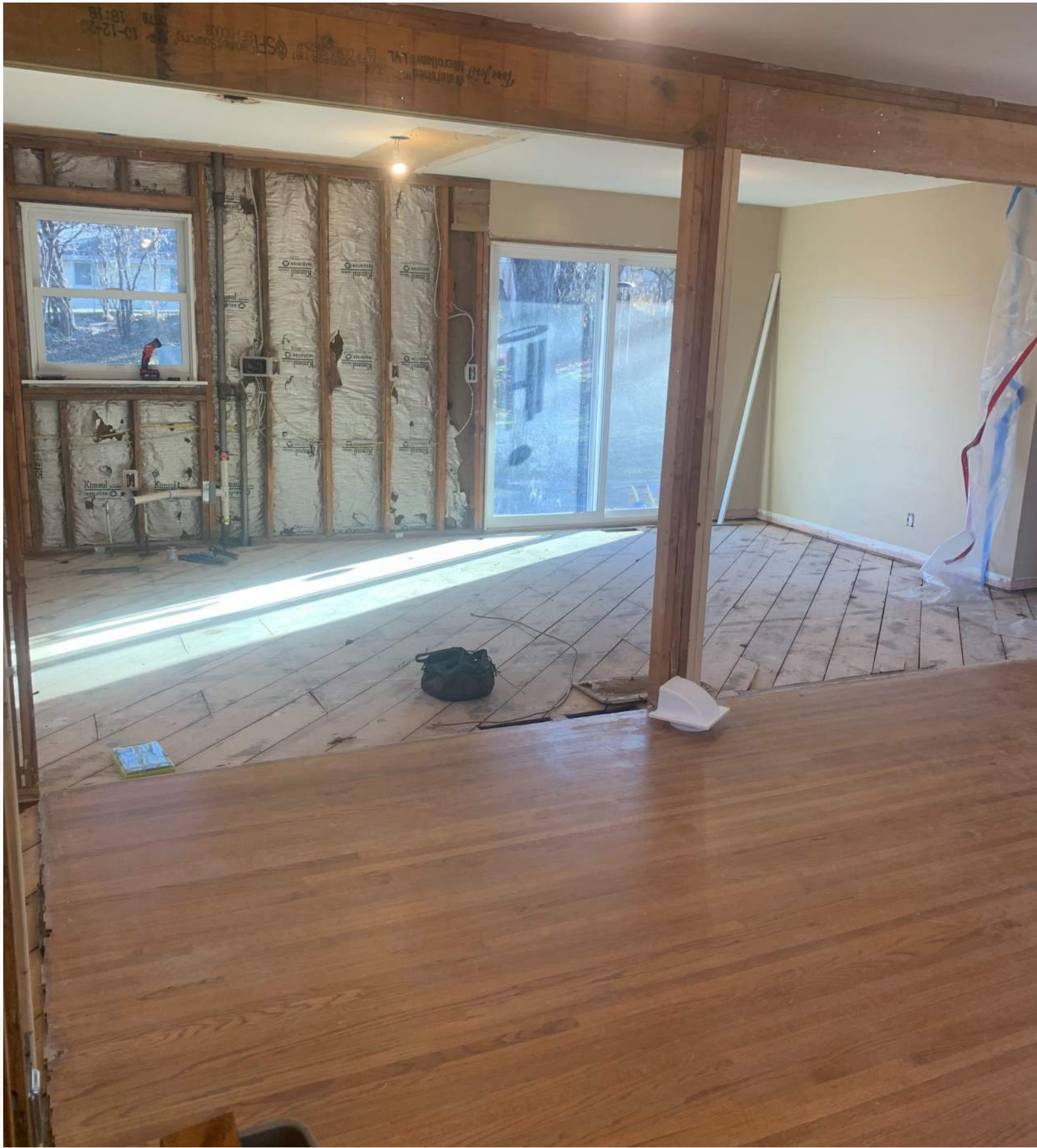
MINNETONKA KITCHEN- COTY AWARDS- RESIDENTIAL KITCHEN