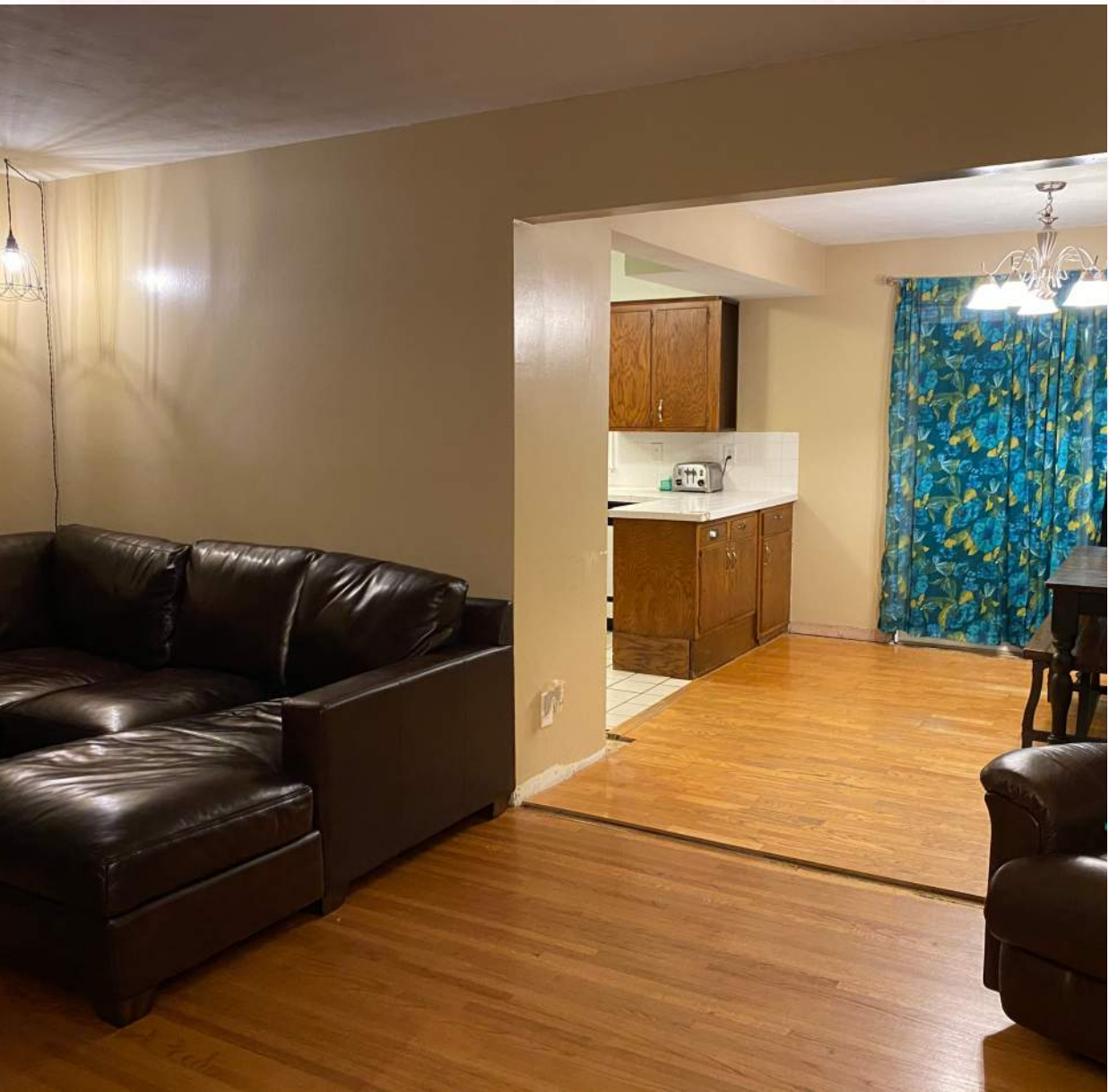
MINNETONKA KITCHEN- COTY AWARDS- RESIDENTIAL KITCHEN