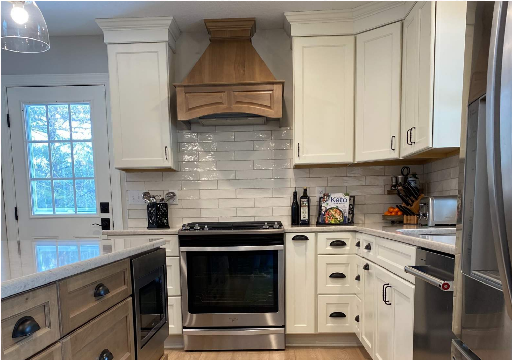
MINNETONKA KITCHEN- COTY AWARDS- RESIDENTIAL KITCHEN