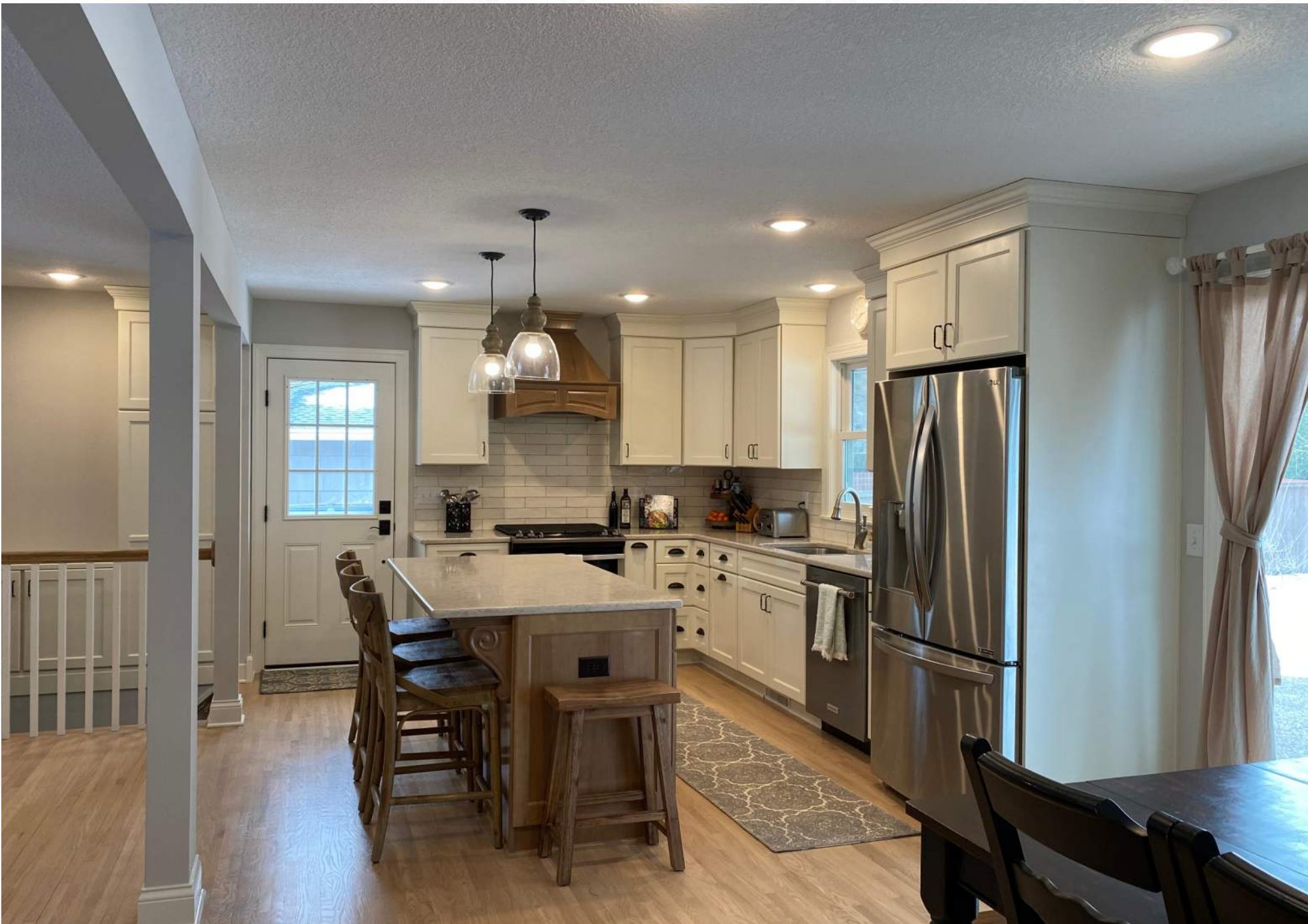
MINNETONKA KITCHEN- COTY AWARDS- RESIDENTIAL KITCHEN