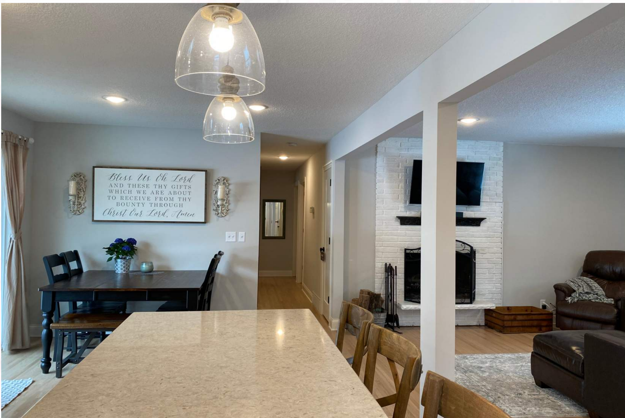
MINNETONKA KITCHEN- COTY AWARDS- RESIDENTIAL KITCHEN