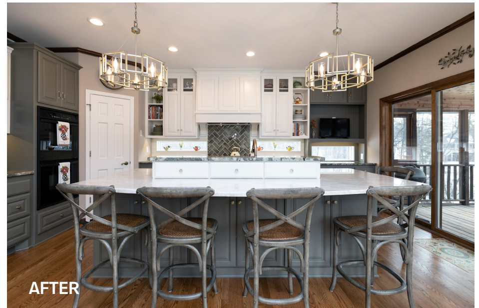
Kitchen BEFORE | DURING | AFTER