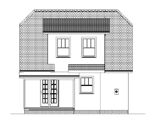
"BEFORE" EAST/REAR ELEVATION