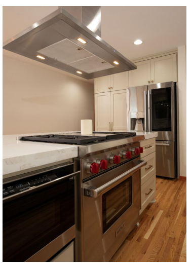
MID-CENTURY MARVELOUS - 2023 COTY AWARDS - RESIDENTIAL KITCHEN