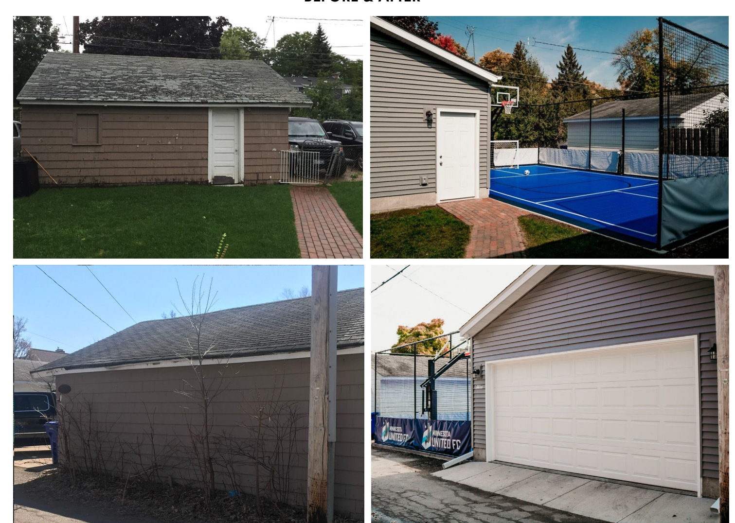
PICK-UP ON THE PARKWAY – 2023 COTY AWARDS – RESIDENTIAL EXTERIOR