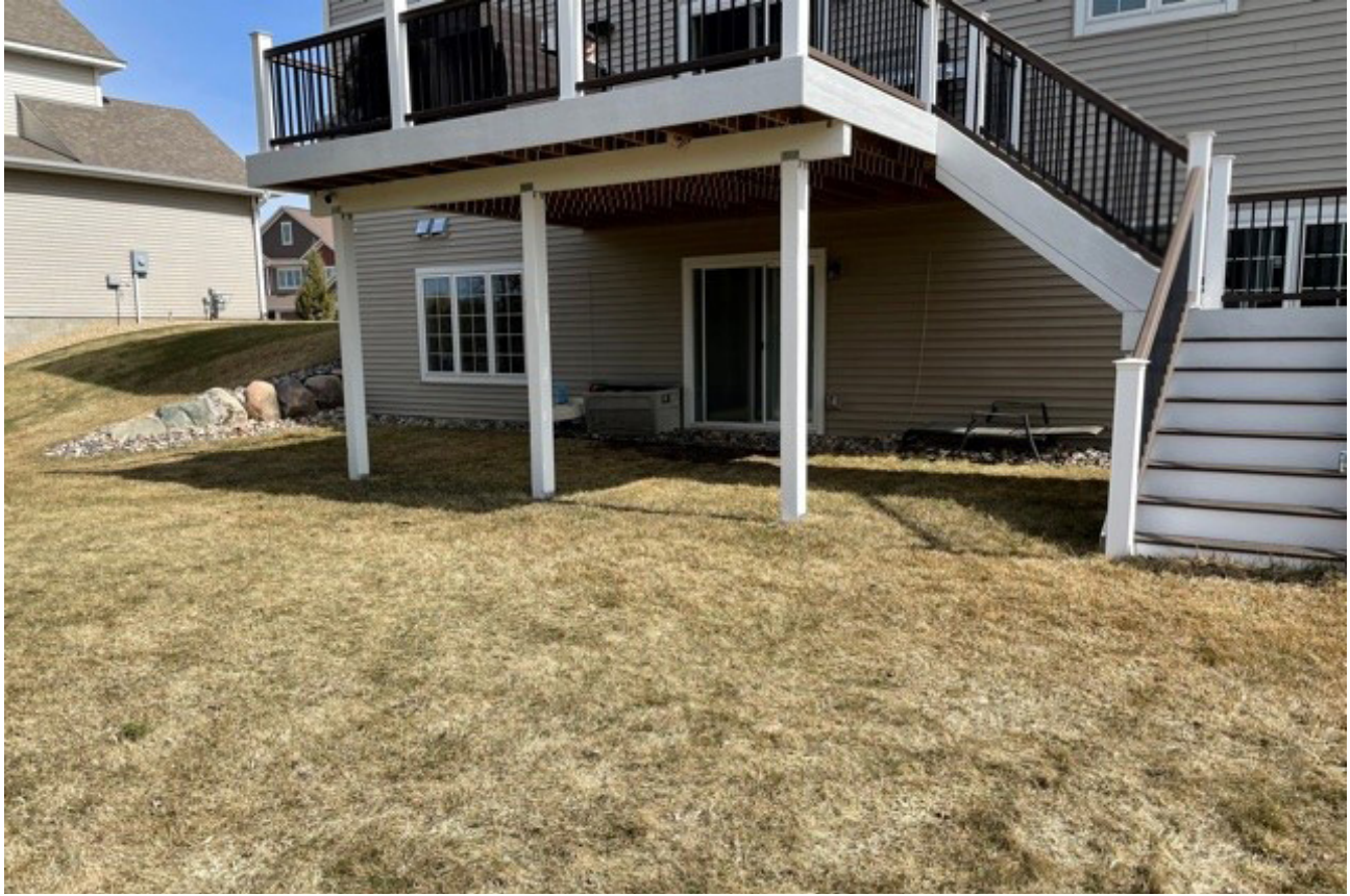
Figure 1: BEFORE Right Elevation