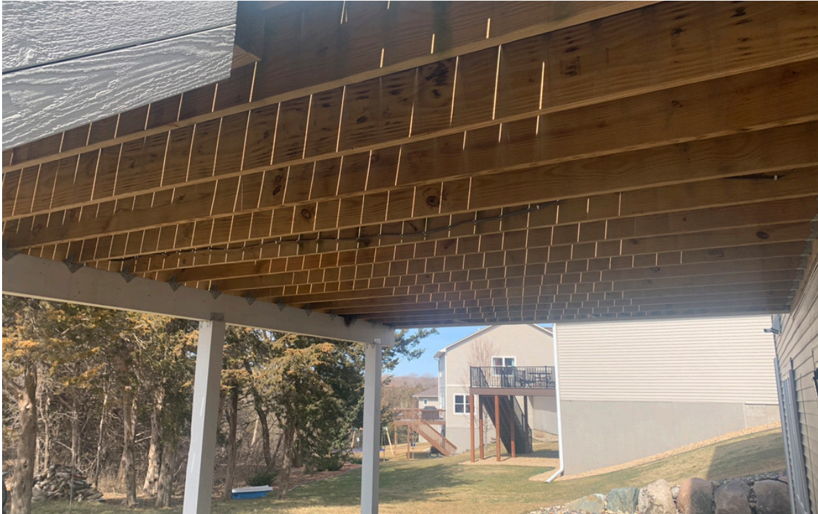
Figure 7: BEFORE Ceiling

To capture that modern cabin, feel, the walls were lined with painted shiplap. The natural wood grain and finish of the solid oak mantle and rough sawn cedar ceiling brought the outdoors inside, with a faint scent as a reminder of the woods. The exterior, though, was another matter entirely. The decision to use James Hardie siding ensured durability while maintaining a wood-like appearance, perfect for Wisconsin's diverse climate.