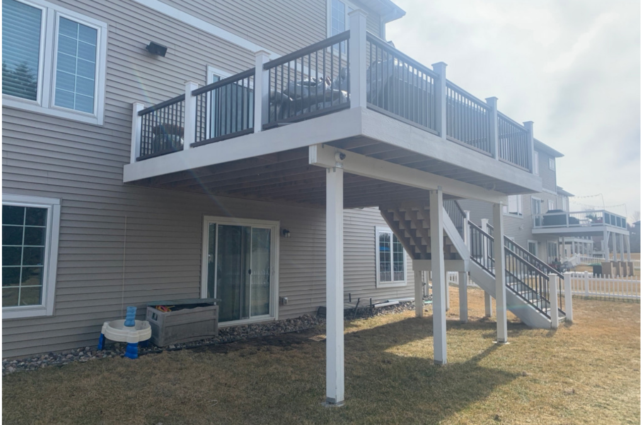
Figure 5: BEFORE Left Elevation