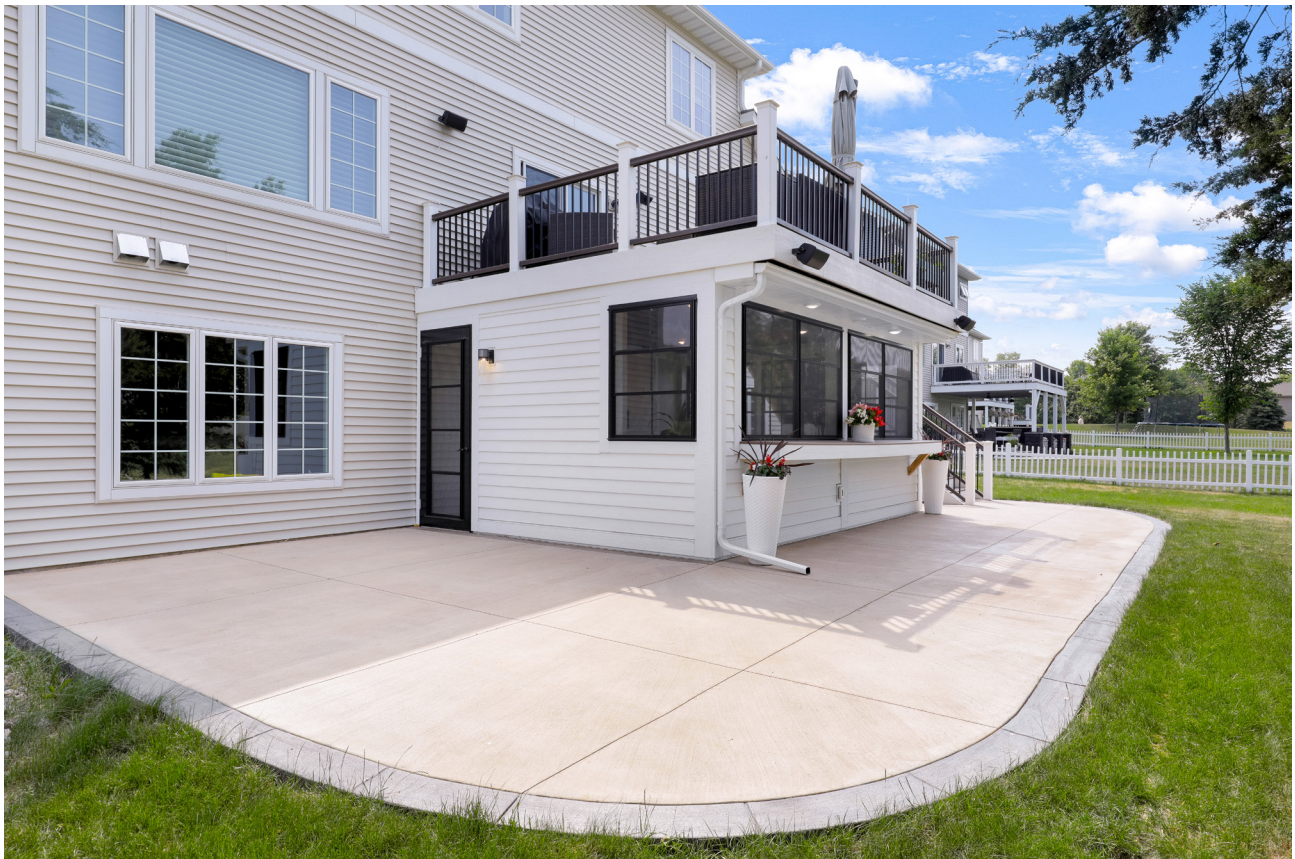
Figure 6: AFTER Left Elevation