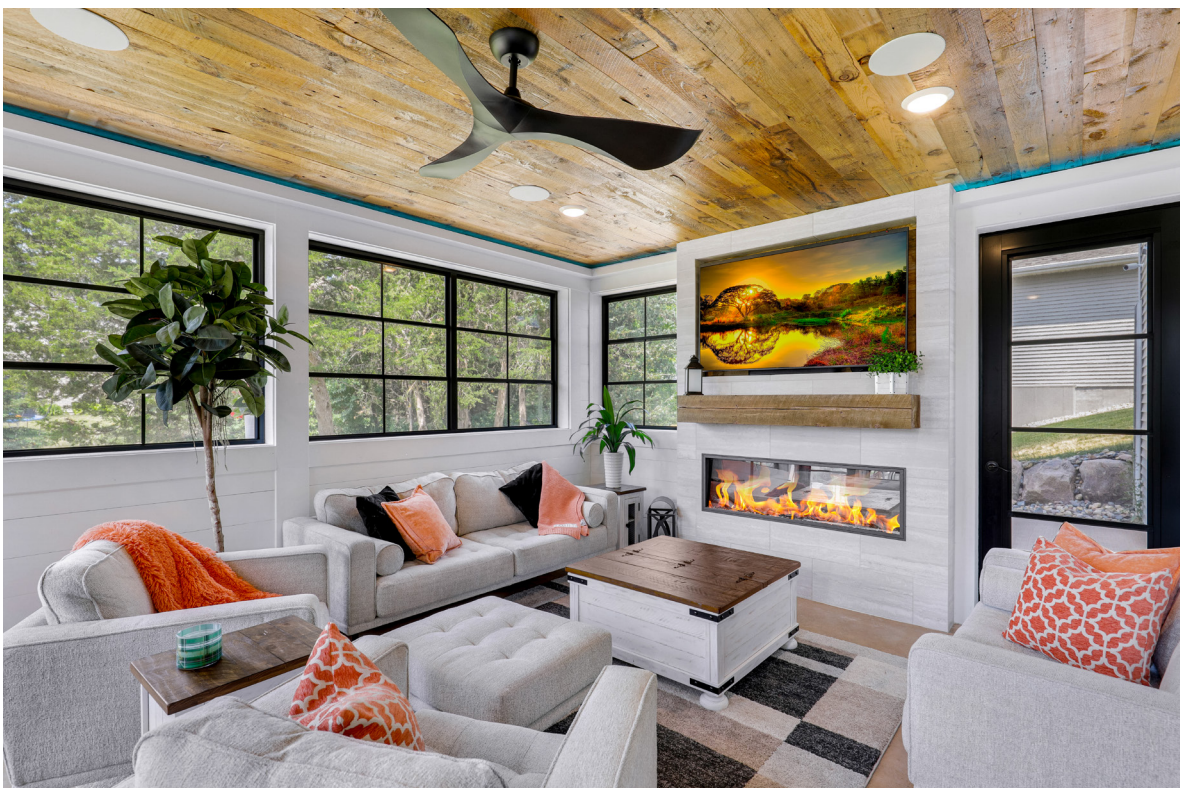
Figure 8: AFTER Ceiling