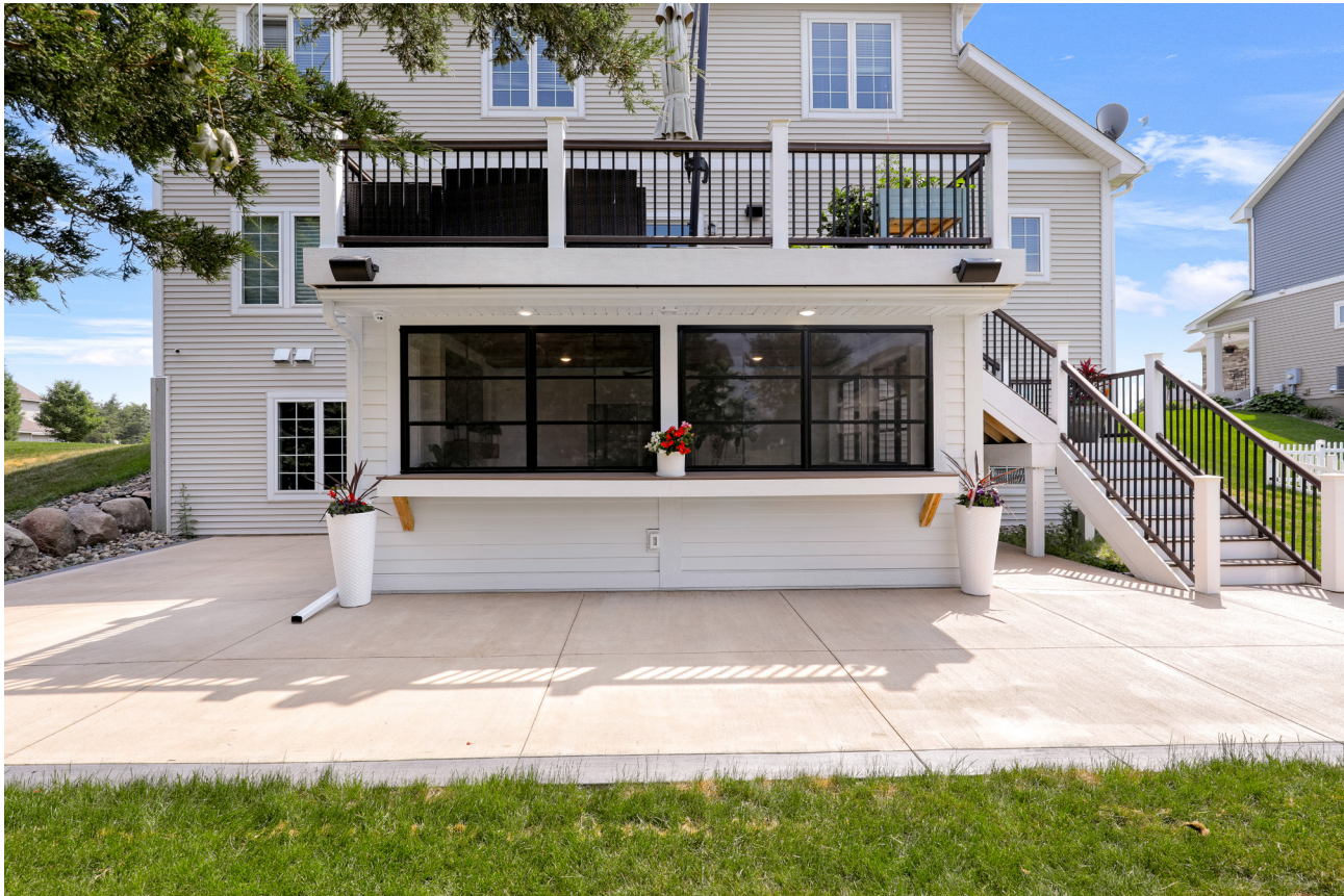
Figure 3: AFTER Rear Elevation

By selecting James Hardie siding, we prioritized both durability and a natural wood-like look, which perfectly suits Wisconsin's diverse climate. To ensure a dry and comfortable porch, we undertook a comprehensive project that involved renovating the existing deck and installing a waterproof membrane (Trex Rain Escapes). The new deck features composite flooring that not only serves its purpose but also seamlessly blends with the rustic cabin aesthetic of the porch below.