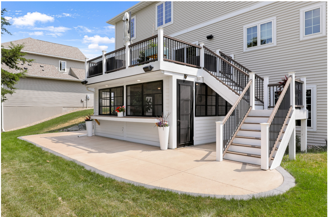
Figure 2: AFTER Right Elevation